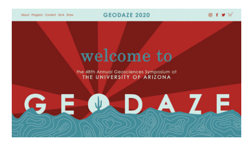
Figure 1. Formatting and design of the GeoDaze 2020 website home page.

The site was built using SquareSpace, a website development platform, and CSS coding for customization. Conference attendees were able to easily navigate from the website home page, which served as a welcome platform with site navigation information and sponsor acknowledgments, to pages containing detailed conference information and scientific content. Traditional conference features, such as a welcome address, program, and conference schedule were available on the About page or in the linked Program, situated in the site navigation as a downloadable PDF. Although attendees could browse conference content at their own pace, the Program offered a suggested schedule to follow if the attendee wished to have a more traditional conference experience. In addition to these features, a conference Store was created to enable e-commerce transactions for conference merchandise, a key fundraising effort that normally takes place during traditional GeoDaze conferences.