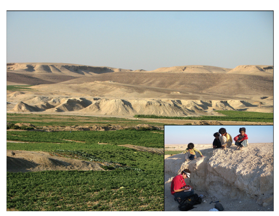
Figure 1. Surficial geologic deposits (late Pleistocene wetland deposits) in Wadi Hasa, Jordan, being described and sampled. These deposits are being lost rapidly to agriculture and disturbance from animal husbandry and human dwellings.

Planning for long-term sustainability also requires an understanding of potential geologic hazards. Surficial geologic records