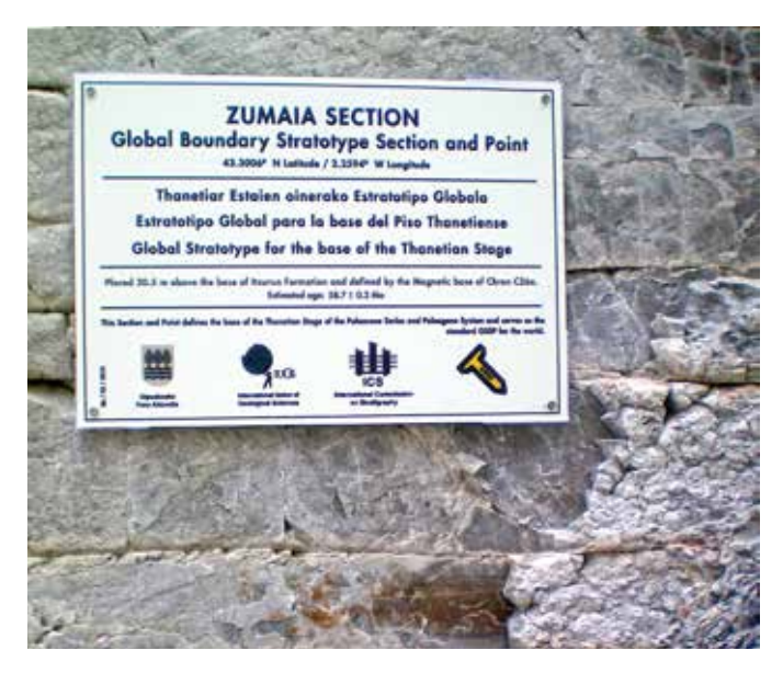
Figure 2. Plaque that marks the Global Standard Stratotype Section and Point (GSSP) for the base of the Thanetian Stage (Paleocene Series, Paleogene System) at Zumaia, the Basque Region, Spain.

Since the first GSSP was ratified in 1972 for the boundary between the Silurian and Devonian systems, 62 of the 100 boundary levels that define the stages, series, and systems of the ICS Chart (download from www.stratigraphy.org) have ratified GSSPs. Most often, these sites are marked with an explanatory panel, a formal plaque (Fig. 2), and a "golden spike" (Fig. 3).