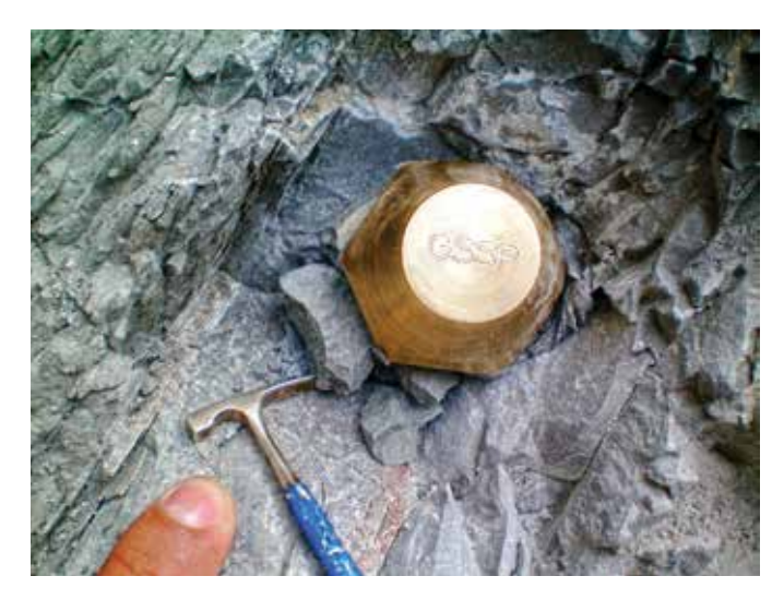
Figure 3. Top of golden spike emplaced in bed that is the Global Standard Stratotype Section and Point (GSSP) for the Thanetian Stage. Length of "rock hammer" is 5 cm.