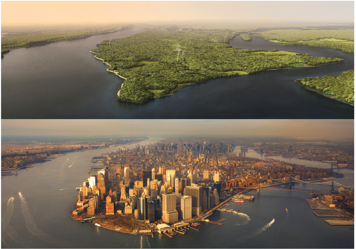
Figure 1. Land transformation: Before New York (top: reproduced from National Geographic Magazine , September 2009, with permission of the National Geographic Society; bottom: New York, USA, © Robert Clark/INSTITUTE for Artist Management).

new ones. All of these studies are based on data collected by the Food and Agriculture Organization of the United Nations since 1961 ( http://faostat.fao.org ). The authors then hindcast and sometimes forecast using satellite, ground-truth, and historical data (Fig. 2). Ramankutty et al. (2008) give values only for 2000. Thus, we adjusted the Ramankutty and Foley (1999) values for cropland in earlier years downward by the percent difference between the Ramankutty et al. (2008) and projected Ramankutty and Foley (1999) values for 2000 (see the supplemental data, Sec. C, for additional details [footnote 1]).