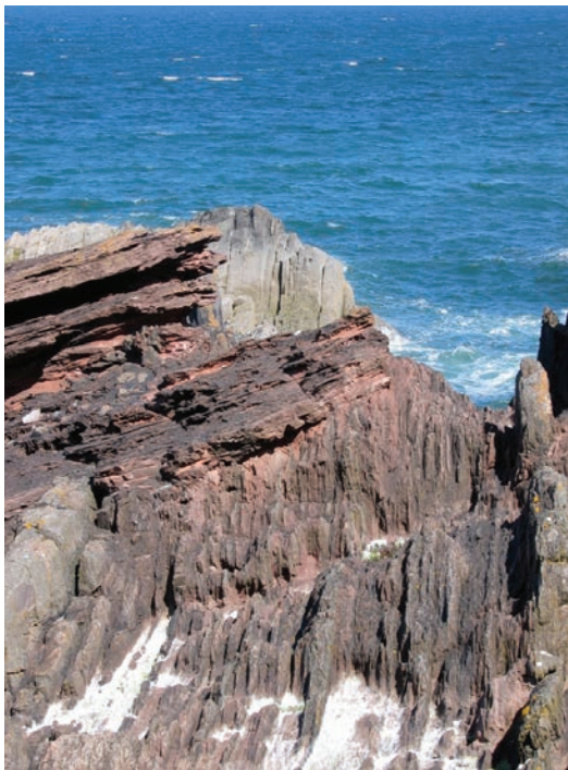
Figure 2. James Hutton's unconformity at Siccar Point, Scotland—the contact between the gently inclined Devonian Old Red Sandstone and vertically dipping Silurian graywacke that established a compelling case for the vast scope of geologic time. The expanse of time required to uplift and erode the two mountain ranges that were the source for the sand in these deposits was unimaginable to Hutton.

A century later, geologic history began to challenge theological tradition after discoveries like James Hutton's unconformity, separating two distinct sandstones, at Siccar Point (Fig. 2) demonstrated that Earth's history was too complicated to be accounted for by a single flood, no matter how big. Mainstream theologians willing to allow that there was more to the geological story than laid out in the Bible, and that the days of creation may have been allegorical, were less inclined to give up on the reality of a global flood. Many believed that the biblical flood inaugurated the most recent geological age. The lack of human remains in rocks thought to pre-date the flood was widely considered to confirm this view.